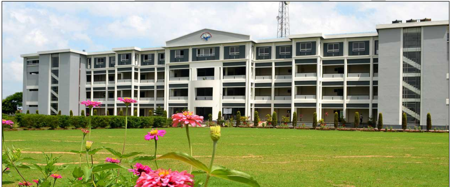
St. Xavier's College, North Bengal