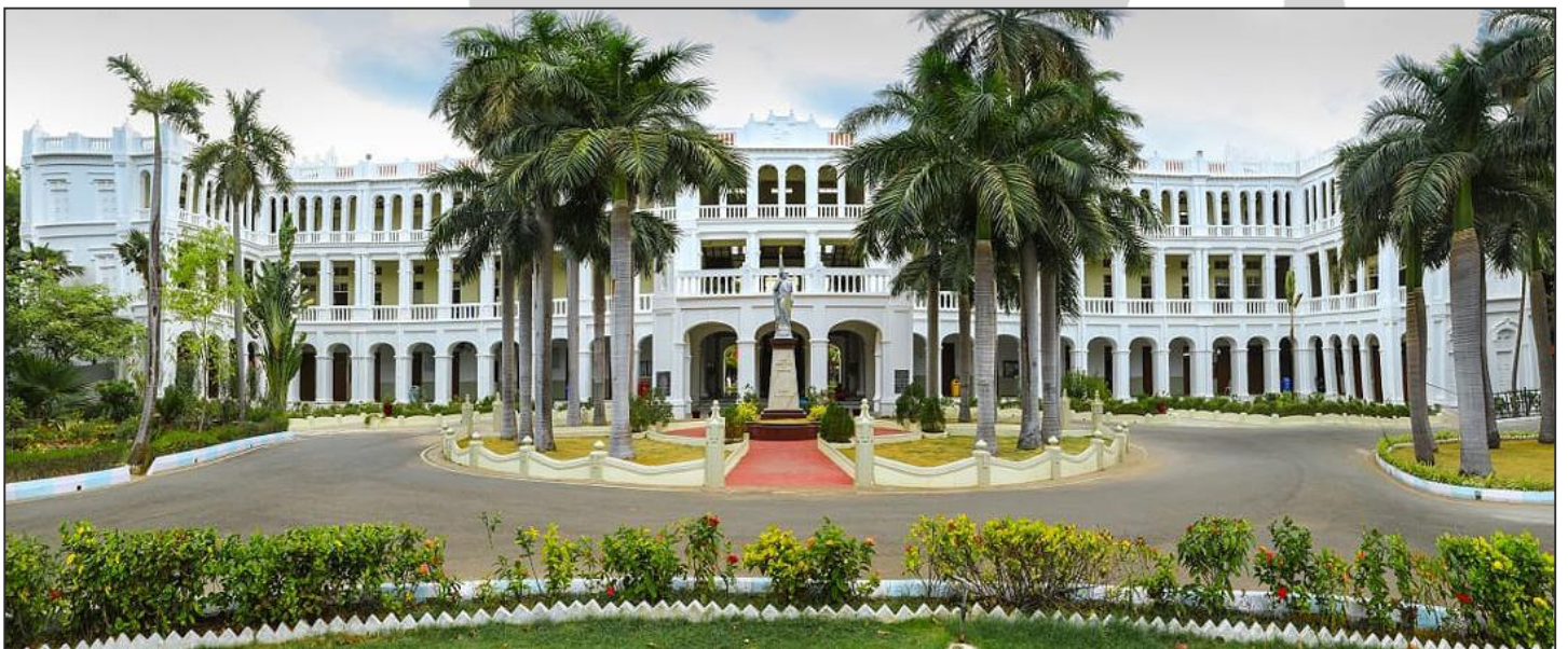
Loyola College, Chennai

Presently there is acute potable water shortage and our next priority is to ensure prevention of water wastage and its retention. True, our planet has no end to its problems. But there is no problem that does not have a solution. Naturally, it is imperative for those concerned about our planet prospering peacefully that they devote all their attention to study and implement in detail for greater awareness of relationships. In the process, they will not only be helping our planet but also doing themselves and modern day civilization a tremendous favour.