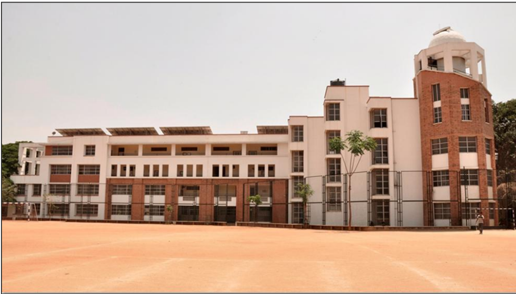
St. Joseph's College, Bangalore