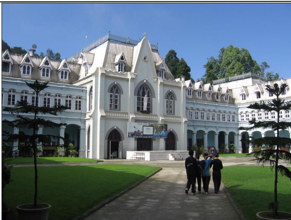
St. Joseph College (North-Point), Darjeeling

True to say, the academic community in Jesuit universities and institutions are the chosen ones to be Lay Jesuits to enjoy a comfortable seat and a pleasurable work-time towards complete commitment and total engagement on campus for nurturing young minds for a better tomorrow. In line with the same, higher education, to be a sustained drive towards the motive of creating global citizens and empowered minds, all intuitions and universities need to therefore somewhat benchmark practices and prioritize their plans and procedures