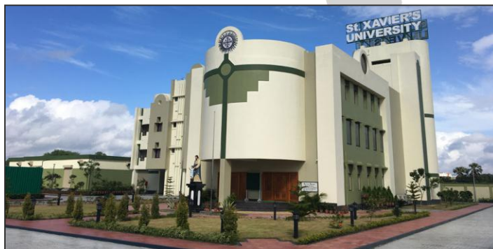
Britto House at St. Xavier's University, Kolkata