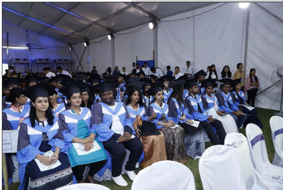
Convocation Ceremony at the St. Xavier's University, Kolkata

The accompanying worry is the outflow of Indian students due to the lack of opportunities available within the country. We need to reverse the doctoral brain drain