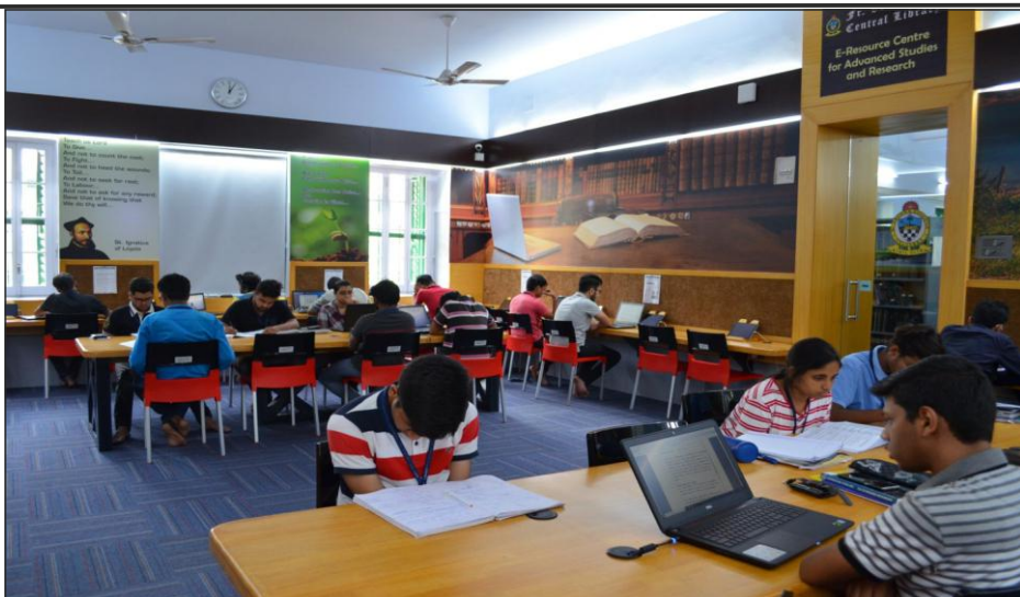
Central Library at St. Xavier's College (Autonomous), Kolkata

Our vision for the 21st century must be to make India a knowledge society. What do I mean by that phrase? To me, a