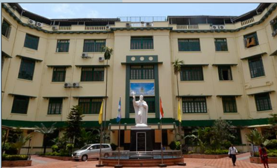
St. Xavier's College (Autonomous), Kolkata

Universities and Colleges by their origin, nature and mandate are communities of masters and scholars of diverse cultures, pursuing a variety of disciplines of thought, but all seeking relentlessly to decipher the secrets of creation, both empirical and meta-empirical, and placing them at the service of human flourishing. Universities represent the world community. These are the ideal nurseries to form global citizens that the world needs today than ever before.