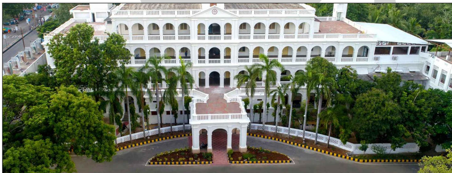
St. Joseph's College (Autonomous), Trichy

An approach towards integral engagement in higher education for being learner-centric to create empowered minds spans across a diverse range of values, philosophies and ideologies. Common areas of thrust may be mutuality,