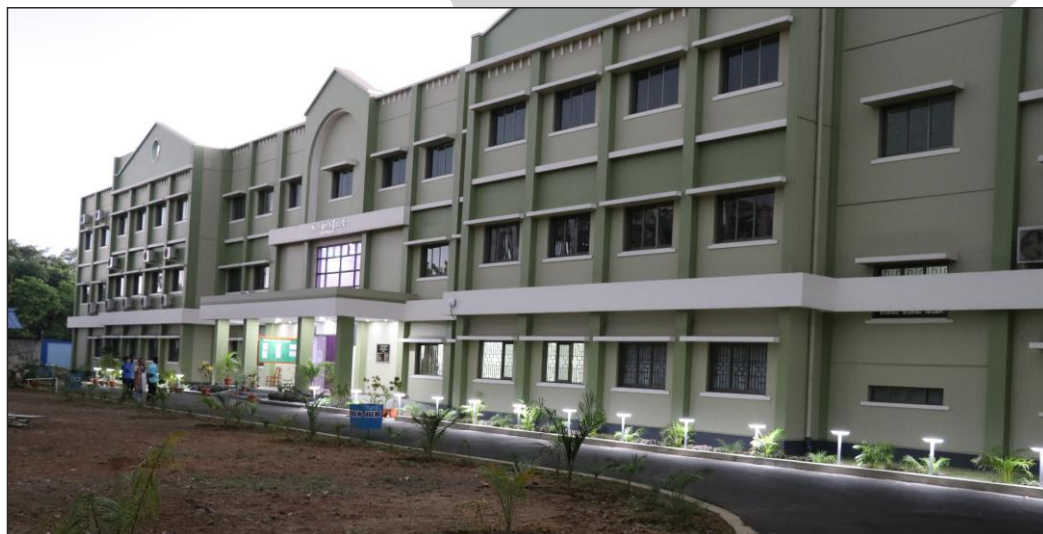
St. Xavier's College, Burdwan

As the Nobel Prize-winning Chilean poet Gabriela Mistral (a schoolteacher herself) so poignantly said, 'We are guilty of many crimes, but our worst sin is abandoning the child; neglecting the foundation of life. Many of the things we need can wait; The child cannot. We cannot answer Tomorrow. Her name is Today.' So let a thousand educational flowers bloom. Now.