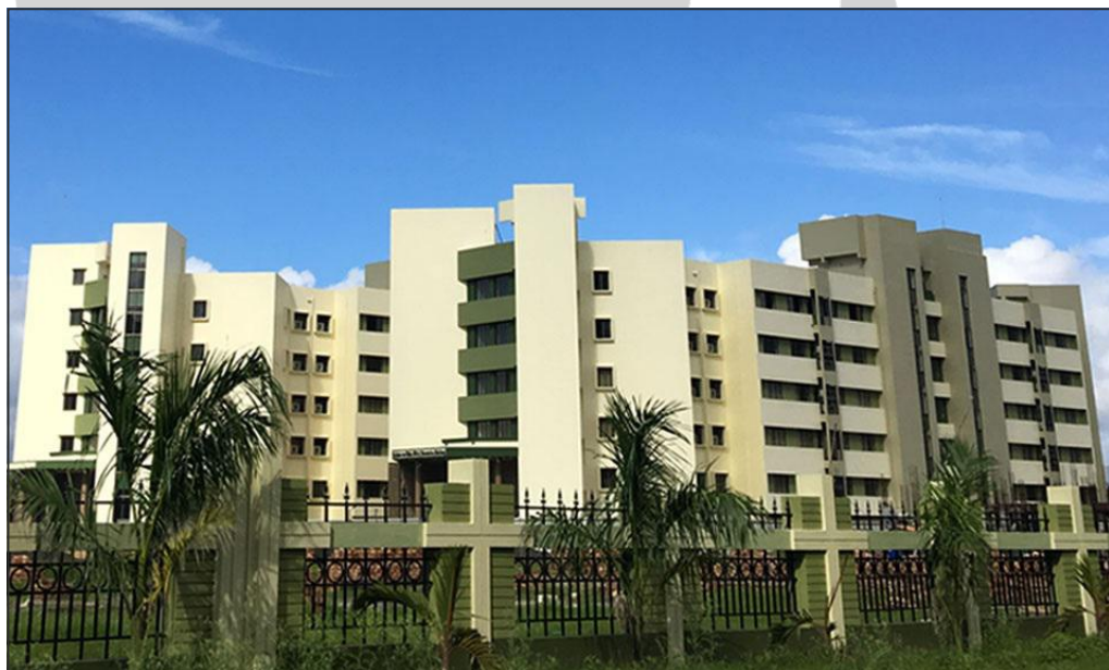
St. Xavier's University, Kolkata

Now in 2019, when I reminisce my days as a young graduate, I think of how few the options available to us in our college